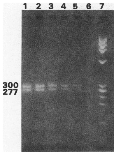
Figure 2. Quantitative analysis of LPL mRNA in macrophages. Ethidium bromide staining of PCR products separated in 4% agarose gel. Lanes 1–5 indicate LPL mRNA PCR products from 1:3 dilutions of a sample containing 1 ng total RNA from macrophages plus 1 \times 10^5 molecules of AW108 cRNA after amplification for 35 cycles. Lane 6 shows the control reaction without template amplified for 35 cycles. Lane 7 is the molecular weight marker.

II). When blood monocytes attach to petri dishes and differentiate into macrophages, they show a transcriptional activation of mRNA for LPL. The expression of LPL mRNA in the total HMDM population cultured for 7 d was \sim 1,600 molecules/cell. To study the CD14-positive subpopulation of HMDM, RNA from Leu-M3-positive cells was isolated from HMDM cultured for 7 d. Low levels of LPL mRNA were detected in the Leu-M3-positive macrophages (Table II). It is unlikely that the difference is due to RNA degradation, since the cells were treated in parallel and stored on ice for the same time. When total RNA was run on agarose gel, the preparations showed the same patterns. A difference in viability between total HMDM and CD14-positive cells may exaggerate the difference, since only 70% of total HMDM were viable while \sim 90\% of CD14 positive cells were viable. In order to exclude the possibility that collagenase treatment of the cells decreases the levels of LPL mRNA, control experiments were performed in which